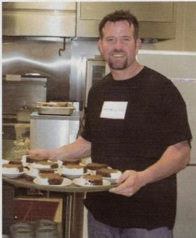
Red Sox fans have come to appreciate Sean Casey for his contributions to the Red Sox in 2008, just as the visitors at the Cor Unum Meal Center in Lawrence, MA are thankful for the time, service and support he offers them.